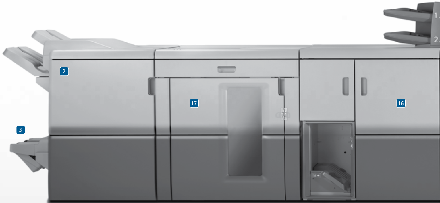
RICOH Pro 8100 Series