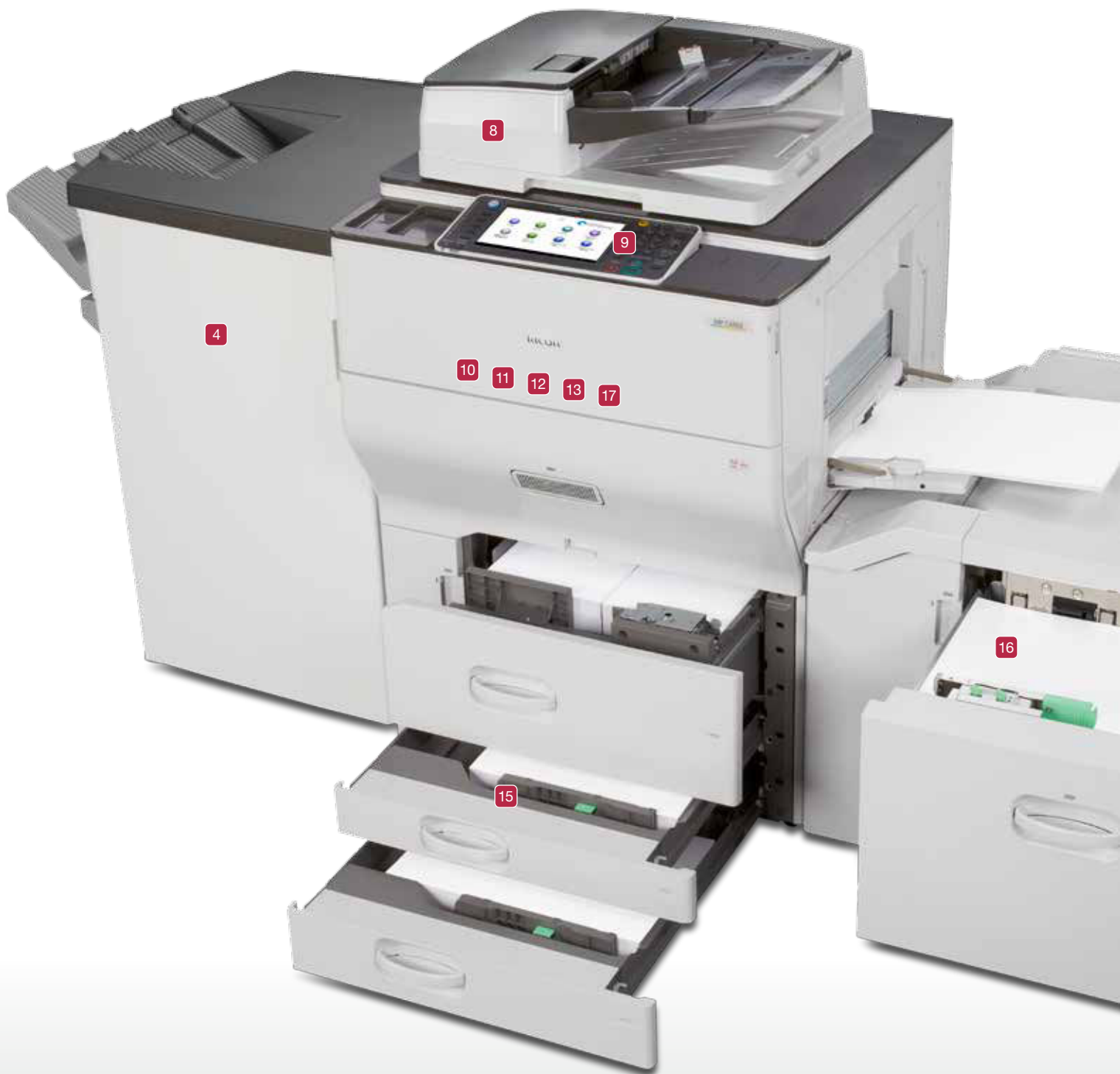
Ricoh MP C6502/MP C8002