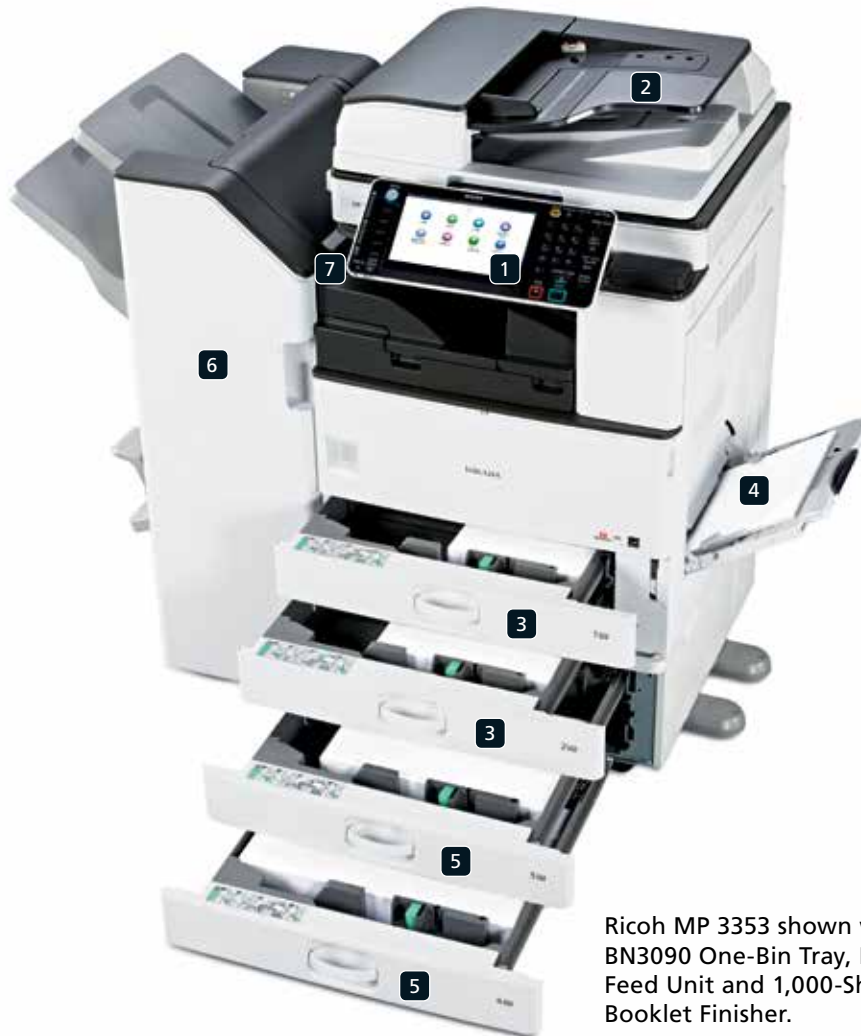
Ricoh MP 3353 shown with optional BN3090 One-Bin Tray, PB3180 Paper Feed Unit and 1,000-Sheet SR3150 Booklet Finisher.