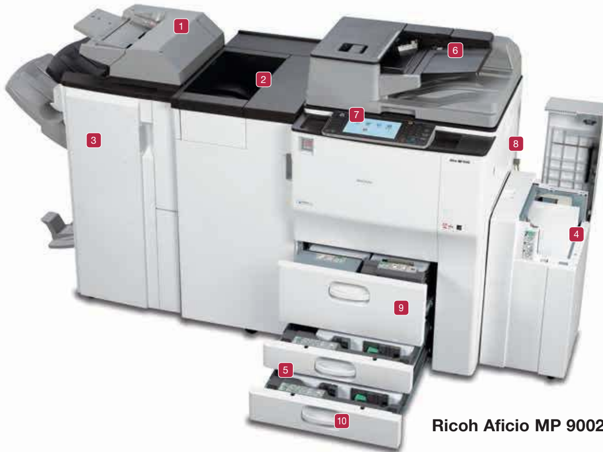
Ricoh Aficio MP 9002